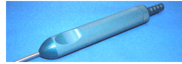
Swivel Barb One Piece $115.00 Allows for easier turning during aspiration.