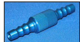
NEW Tube Swivel Adaptor

Thank you for your interest in our Cannula product offering. Please contact an AMT Sales representative to help with a custom order. Again, please let us know if there is something that you would like that you don't see here.