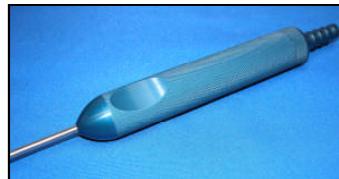
NEW One-Piece Swivel Barb Handle